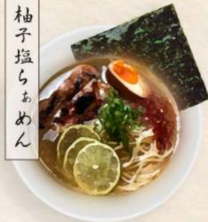
YUZU SHIO (A)(S)(E)

Chicken Broth with Yuzukoshu and Koji Chicken