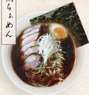
DUCK RAMEN (E)

Duck broth, cured duck slices, braised deck leg with a sweet sauce on the side