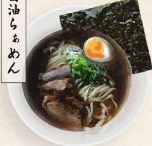
SHOYU RAMEN (E)

Chicken Broth with Shoyu Tare, Served with Thin Slices of Tenderloin