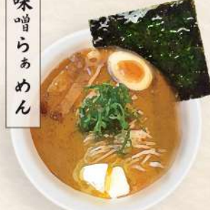
SPICY MISO RAMEN (E)(S)(D)