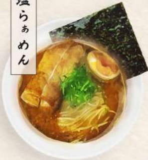
SHIO PAITAN RAMEN (E)

Our Chef's Special: Slow-Cooked Chicken Broth with Dashi, Served with Seared Chicken and Drizzled Mayo